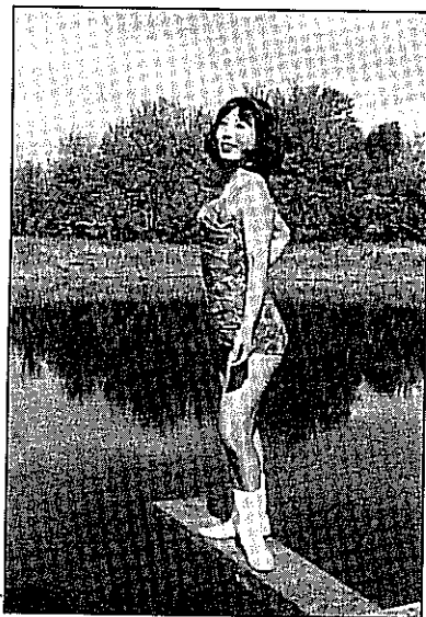
Anonymous male cross-dresser at Casa Susanna, a private resort for cross-dressers in New York’s Catskill Mountains from the late 1950s until the early 1960s.

we all manipulate in an attempt to communicate to others our own sense of who we feel we are—whether we wear clothing with a neckline that emphasizes our cleavage, or whether we allow hair stubble to be visible on our faces. In this sense, all human bodies are modified bodies; all are shaped according to cultural practices. Shaping the body to represent oneself to others is such an important part of human culture that it’s virtually impossible to practice any kind of body modification without other members of society having an opinion about whether the practice is good or bad, or right or wrong, depending on how or why one does it. Everything from cutting one’s nails to cutting off one’s leg falls somewhere on a spectrum